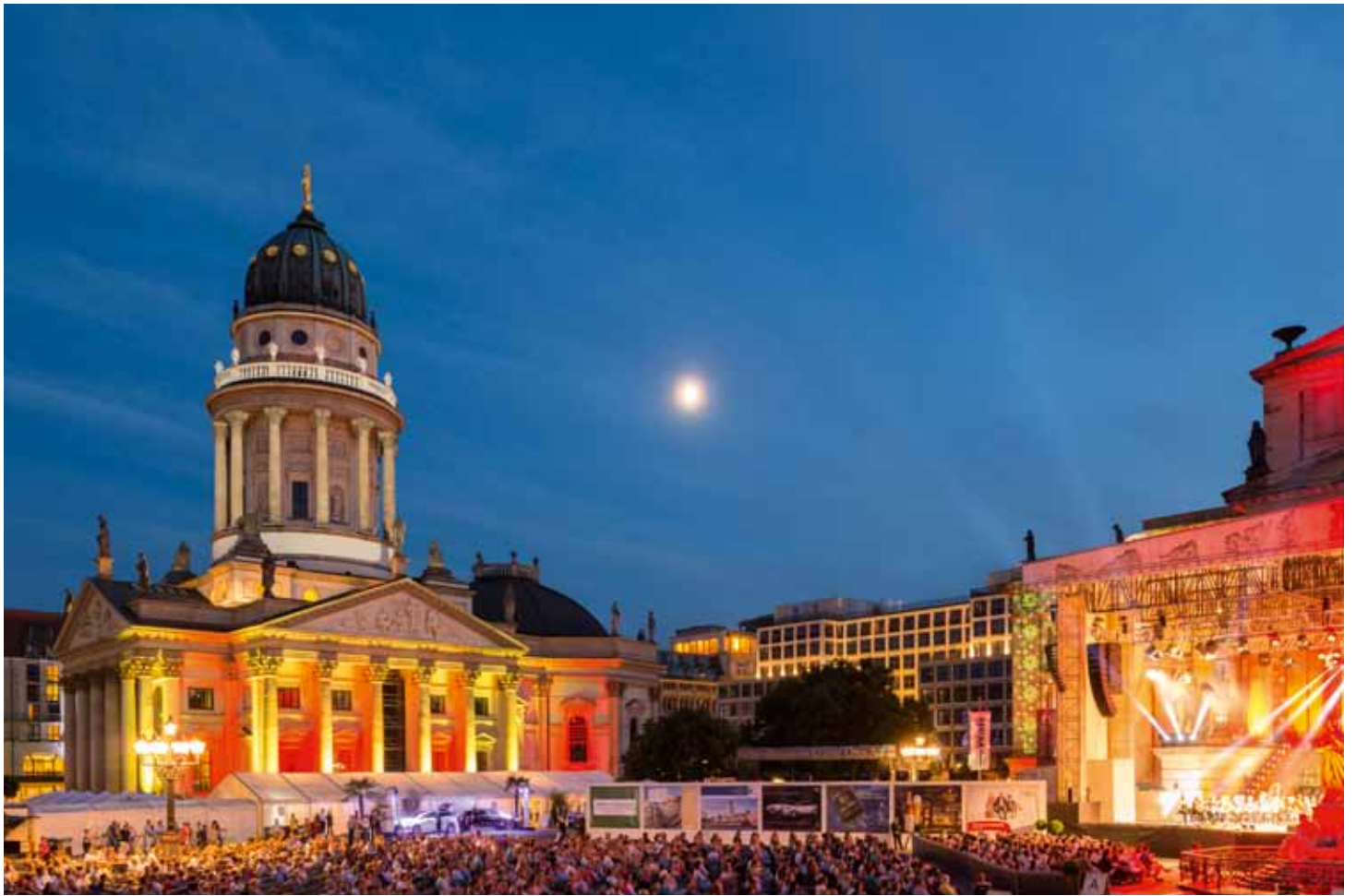
The Deutscher Dom on Berlin's Gendarmenmarkt, illuminated as part of the 23rd Classic Open Air Festival, in July 2014.