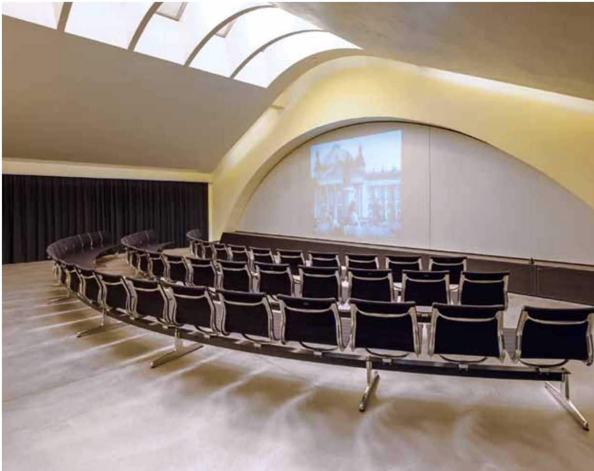
Above: The exhibition's cinema can seat 54 visitors.